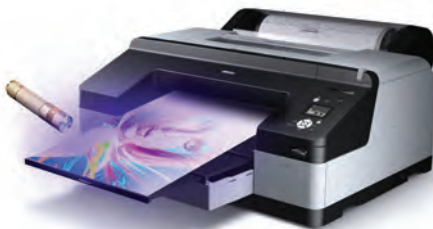
VersaJette Stealth™ 3