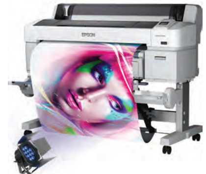
VersaJette Stealth™ 4