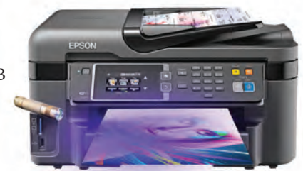
VersaJette Stealth™ 2