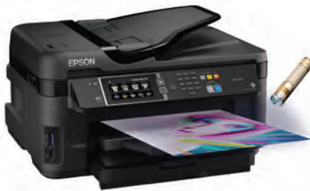
VersaJette Stealth™ 1