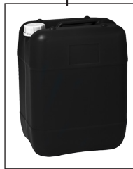
Bulk Ink Container

Connect your inkjet system to INKVERSE™ and gain access to an unlimited ink variety and dramatic cost savings!